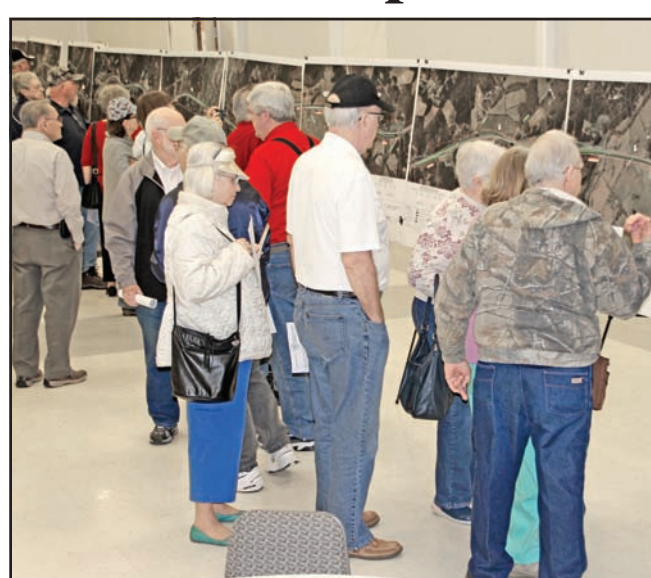
A recent GDOT Public Information Open House in Blairsville on Feb. 21.

designated project will cost around $100 million, and will widen SR 515/US 76