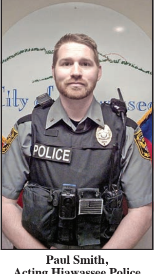
Acting Hiawassee Police Chief