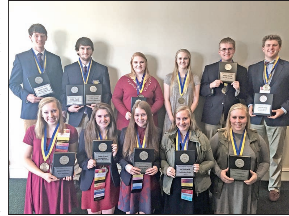
Towns County High School FBLA State Leadership Conference Winners